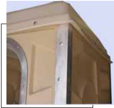
2" Aluminum Corners For Durability