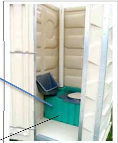
Front View of Flip Top Tank

Our reference list (see below) is testimony to the success of the portable toilets we manufacture and service. The Green John® offers long-term low maintenance sanitation.