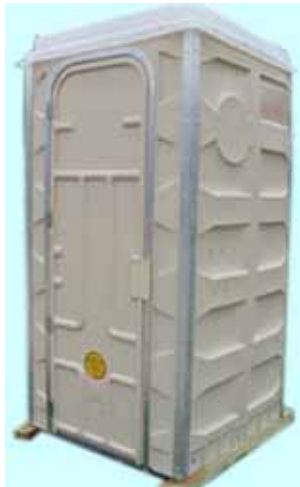
One Piece Aluminum Door Frame