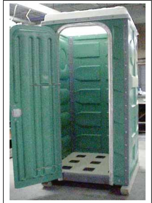
Flat Floor Model GJFF 350