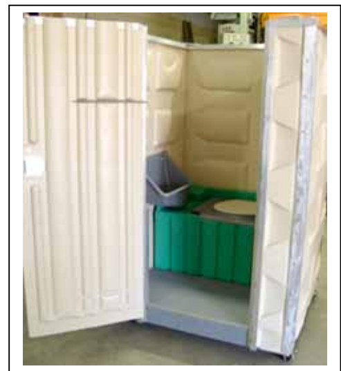
Cut Off Model GJ 350CO